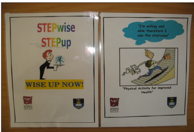
Fig. 1. Message displayed in signage.

Observational data collected by the researcher during the days and times specified were transformed into a percentage of number recorded and were subdivided into exercise science students/staff member (ESSM) and non-exercise science students/staff member (non-ESSM). The data were further stratified into gender-specific categories.