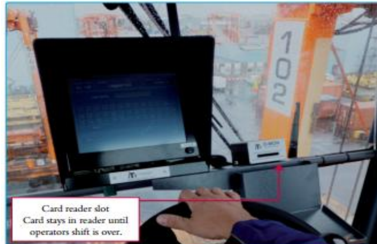
Figure 3: Card system used in operations