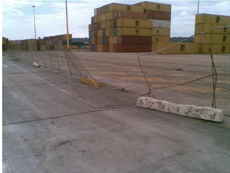
Figure 1: Fence damaged by a SC