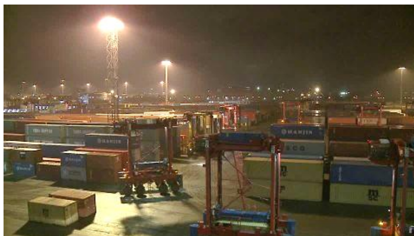
Figure 4: Using LED floodlights at the Port

LED technology also offers a great deal of versatility. If a port operator prefers a warmer light source, lenses can be inserted over the luminaire to decrease the colour temperature. Furthermore, a modular design of LED fixtures allows for customisation specifically for crane heights. The directional nature of LED light allows for improved light penetration at the bottom of the vessel hold and improves operator viewing conditions.