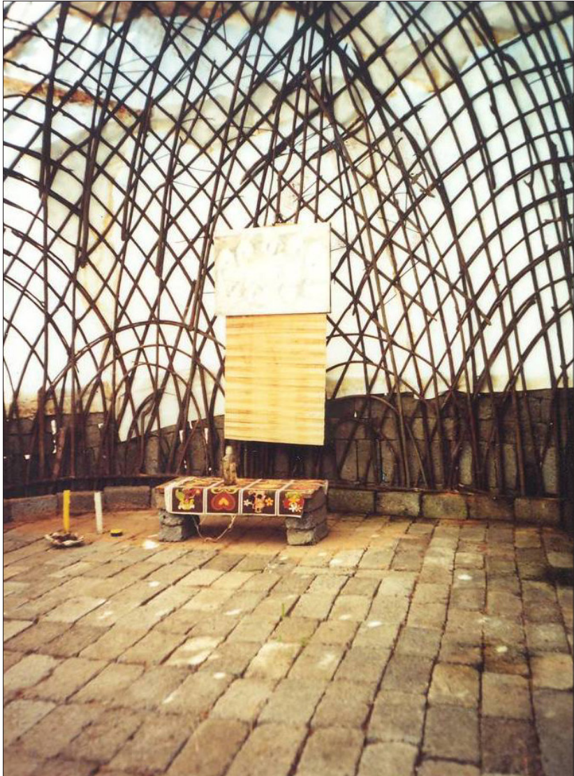
Figure 4: Ancestral building, Richards Bay ca 1998, interior