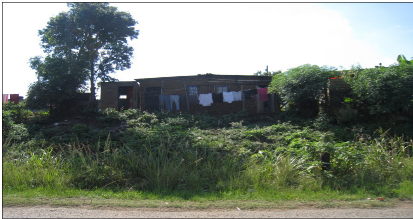
Figure 5: Informal dwelling, Happy Valley near Pietermaritzburg

Lack of space within these layouts could, to some extent, be a generator of the squared-off shapes. However as mentioned earlier, it is suspected that the form is of infinitely greater symbolic value, in that it firmly represents the move to urban areas, and residence in the liminal space between Westernised society and the roots of traditional origins, as in the square buildings found in rural areas being symbolic of the transition between urban and rural societies.