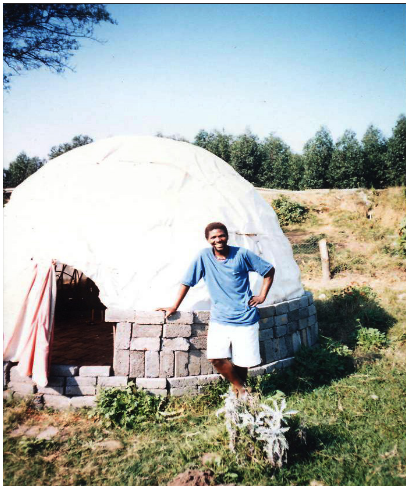
Figure 3: Ancestral building, Richards Bay ca 1998