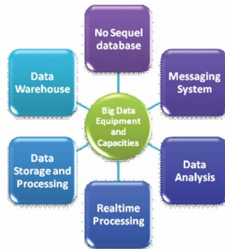
Fig. 2. Big Data Equipment & Capacities

Standard data management technologies are also important elements in the management of large amounts of data. This includes the data assimilation software that supports numerous assimilation methods, including such conventional ETL processes; a suitable ELT reach that fills up information into big data systems in its raw form [16]; and information connectivity software that supports multiple connectivity methods, including such traditional ETL processes. The data is stored in a format that may be converted later if necessary; and genuine ensure the consistency such as modification data gathering are used. As well as manual characterization and cleaning, data integrity solutions that automate the process are also often utilized.