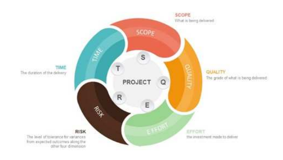
Fig. 1. The SQERT Model

To bridge the gap discovered in the literature analysis, the SQERT model was adopted. This model is a periodic trend analysis report specific to projects that helps us to look at project constraints. It is a useful model presentation for Project Management field experts. This will include scope, quality, effort, risk and time as the typical project constraints to examine the planning, execution, and implementation of what it will take to finish a project as presented in Fig 1.