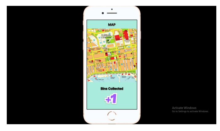
Fig. 3. The Prototype of a Software System

Fig 3 shows the prototype model for the software end of the waste management system. It can use locating and monitoring technologies installed to the bin which gives more information about the situation of a bin. It has a map that shows bin route location which is useful for a binman for directions to where they can find a bin. It also has a bin counter which displays the number of bins collected for that period. The data collected by this counter is set to be useful when it comes to monitoring the working patterns of binmen. This makes the collection process easier and beneficial for the organizations utilizing this software in their waste management system.