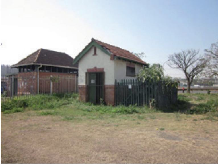
Figure 9: East Street substation and associated public toilets, late 1930s