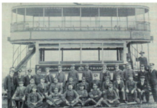
Figure 3: “A new type of tram” 26