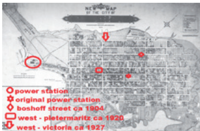
Figure 1: Annotated Secadanari Map, 1906. Note the Electrical Power Station as the dark spot to the left of the city (annotations Author 2014)