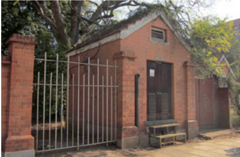
Figure 8: HE White's Longmarket Girl's School Transformer station – 1931

laying, and great emphasis placed on the quality and proportion of mixes. 48