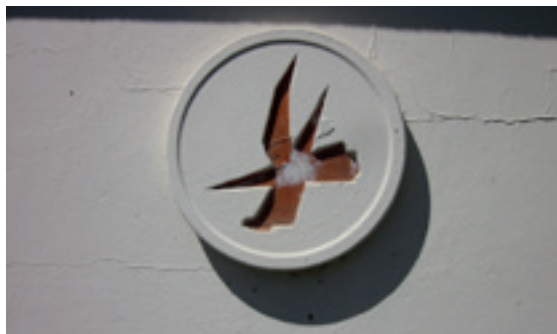
Figure 4: Running man

Whilst the aforementioned “Assisted Wiring Scheme” formed a fundamental part in the development and popularisation of electrification in the city, a means by which people were made aware of its dangers was also being formulated, namely the branding intended to signify “beware”. One of the earlier examples, known colloquially as the “Running Man” depicts a spiky individual with a pointed hat. This was replaced by the distinctly Modernist example from the late 1950s with the characteristic “lightning bolt” as a mutually understood signal of danger. 40