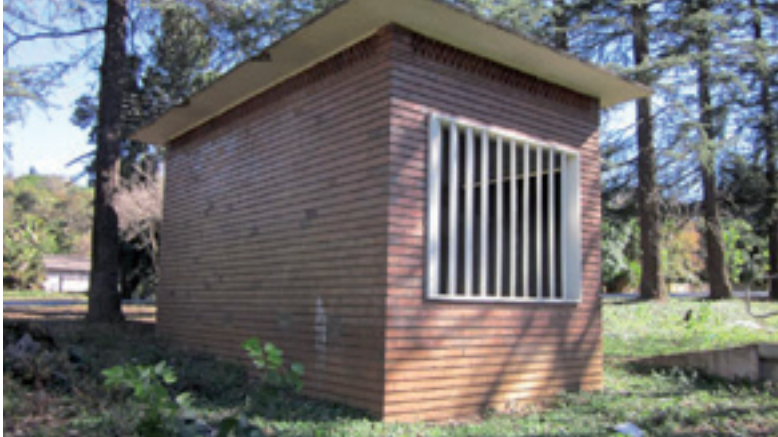
Figure 10: Substation – Sweetwaters Road, possibly designed by Noel

have become patterns in themselves: they have precedent and in themselves create precedent.