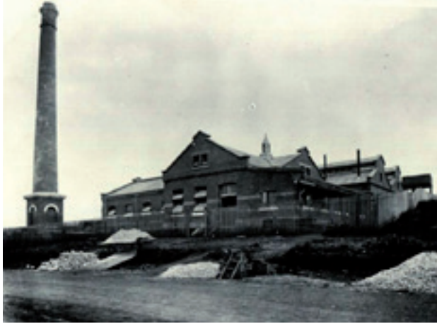
Figure 2: Pietermaritzburg Power Station