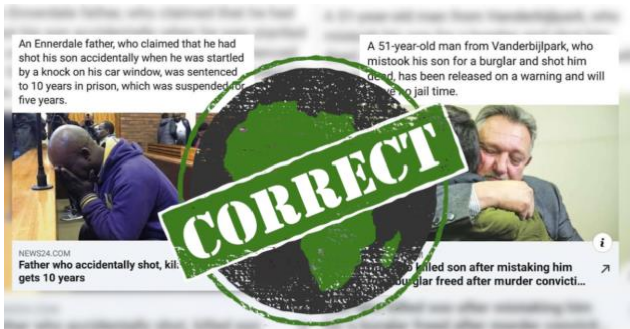
Figure 4: reports on both fathers

The verdict that was passed in both cases found both fathers guilty for culpable homicide and they both used firearms but the sentences are not the same. The black father was sentenced to an effective ten years' jail term and five years suspended sentence. The white father was sentenced to 10 years of a suspended sentence. A black man in South Africa is still seen as a suspect, crime in South Africa is associated with blacks. How the newspapers reported these two cases is also displaying a message that black people have normalized crime.