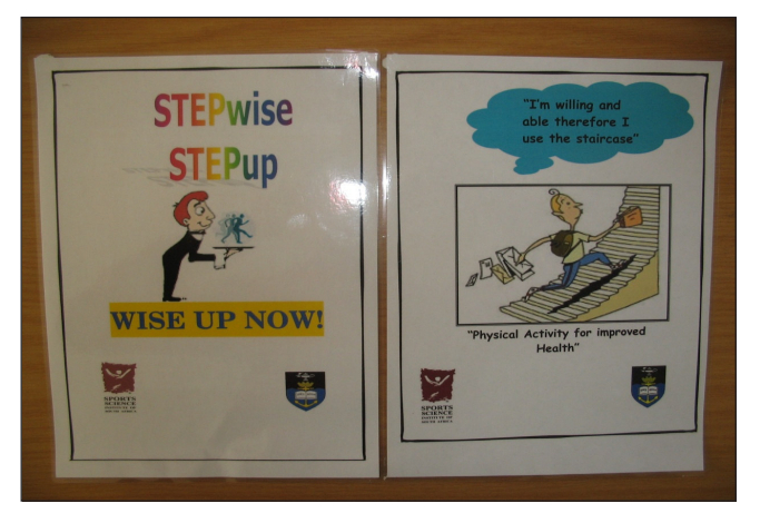
Fig. 1. Message displayed in signage.

In the 3-week observational study, a simple time-series design of collecting data before, during and after the introduction of an intervention was used. The first phase of the study was the pre-intervention phase, the second was the intervention phase and the third